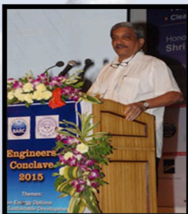
Late Shri Manohar Parrikar, the then Hon'ble Raksha Mantri delivering the Inaugural Address during EC 2015.