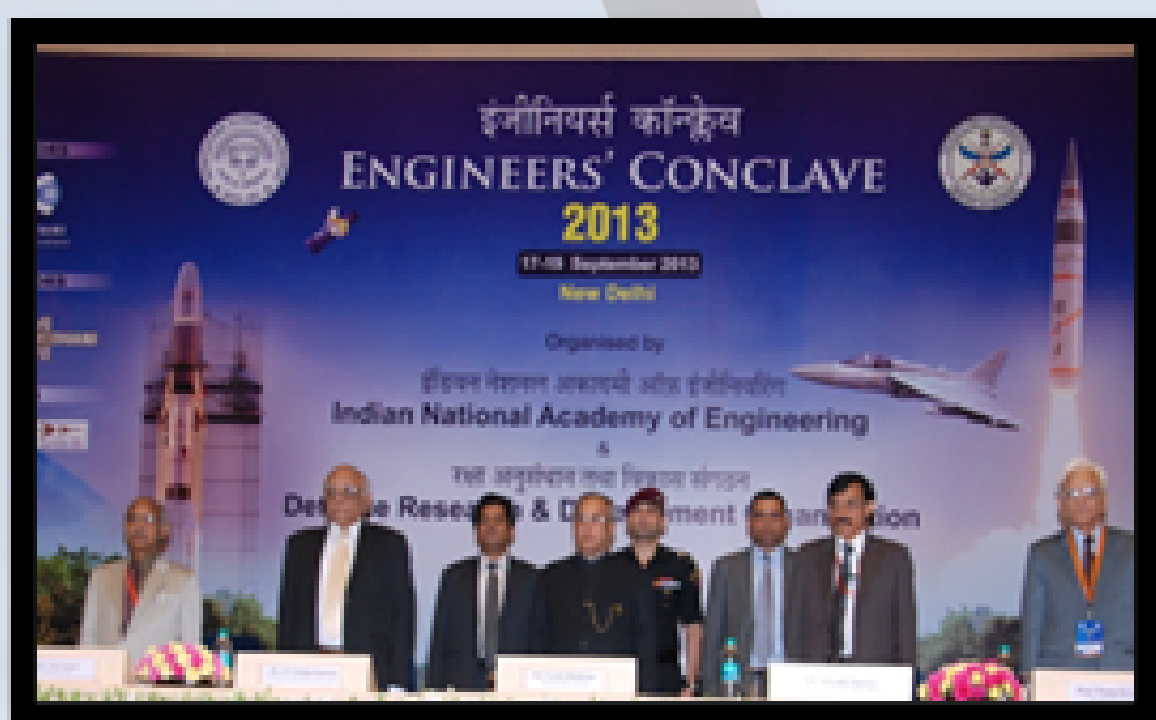
Erstwhile Hon'ble President of India, late Shri Pranab Mukherjee, Chief Guest at the Inaugural function of Engineers Conclave 2013 at Vigyan Bhawan, New Delhi on September 17, 2013.