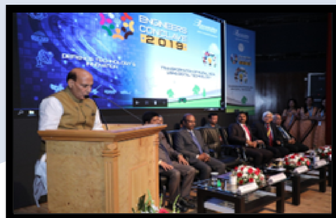
Shri Rajnath Singh, Hon'ble Raksha Mantri delivering Inaugural Address during EC 2019.